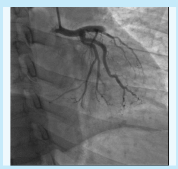
Figure 3 : A 4.5 \times 20 mm bare metal stent was placed at the proximal left anterior descending artery to restore normal TIMI flow grade 3.

Regardless of the underlying mechanism, acute myocardial infarctions are currently treated in a standardized fashion, simply because they all look alike in coronary angiography. The primary treatment objective in patients with STEMI is rapid restoration of TIMI III flow; usually achieved with stenting. Coronary angiography cannot only identify the underlying pathology but also deprives us from understanding the natural history of different types of plaques, that's why intra coronary imaging would be the ideal solution to define the mode of disruption at the time of the acute coronary syndrome. There was regional wall motion abnormality with hypokinesia of the anteroapical wall with estimated left ventricular ejection fraction of 35-40%. Blood tests revealed isolated but severe thrombocytosis with 1220 \times 10^9 platelets /l, the rest of the hemogram was normal. Liver function test results were normal.