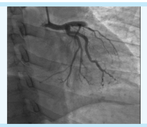
Figure 2: Left coronary angiogram showing thrombotic occlusion of the proximal left anterior descending artery with TIMI 0 flow.

5 minutes later the patient presented a cardiac arrest (ventricular fibrillation) which was resuscitated by an external electric shock. He was transferred immediately to the cardiac catheterization laboratory for primary percutaneous coronary intervention. the patient underwent urgent coronary angiography, revealing an acute occlusion by an intramural thrombus of the proximal LADA with TIMI 0 flow. There was no other significant lesion [figure2]. A Bare metal stent was successfully implanted in the proximal LAD, this was because we did not have a drug eluting stent at the time of angioplasty [figure3]. Anti GP IIb IIIa and in situ thrombolysis were not used given that the patient was not previously diagnosed with ET.